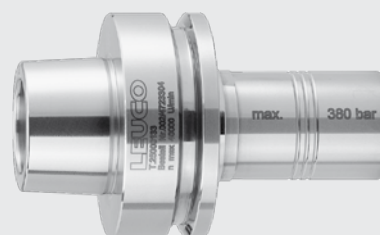
Tribos power shrink-fit chuck HSK 63 with HSK shank