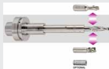
Flexible use of shank-type cutters thanks to the Tribos extension