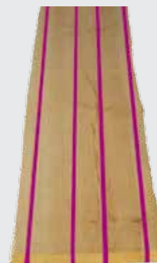
Dividing cuts of different widths according to customer demands