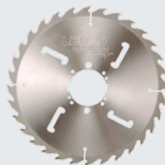
LEUCO HardRip Gang-Rip Saw Blade in topline quality